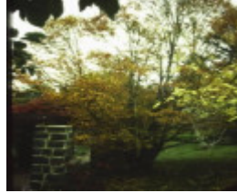
T11667 Sorbus alnifolia