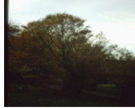
T11667 Sorbus alnifolia