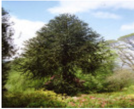
T11675 Araucaria araucana