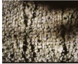
T11675 Araucaria araucana bark