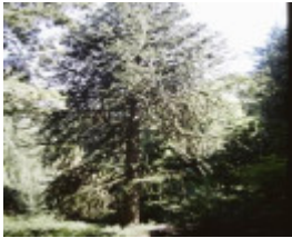
T11675 Araucaria araucana