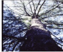
T11680 Larix decidua