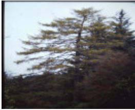
T11680 Larix decidua