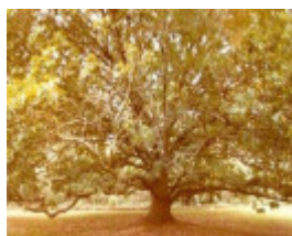
T11722 English Oak