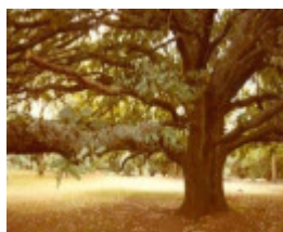
T11722 Quercus robur Branches