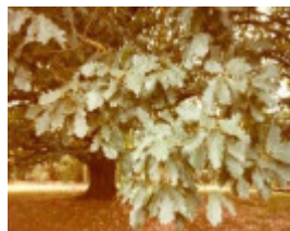
T11722 Quercus robur Foliage