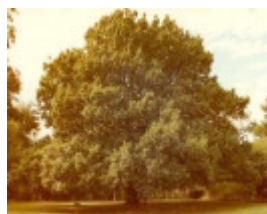
T11722 Quercus robur