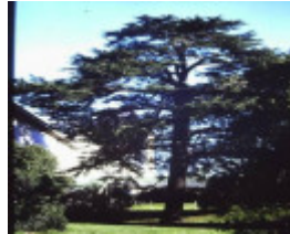
T11758 Cedrus deodara