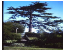
T11758 Cedrus deodara