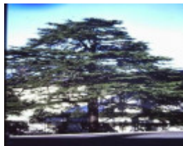
T11758 Cedrus deodara