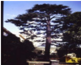
T11758 Cedrus deodara