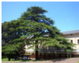
T11758 Cedrus deodara