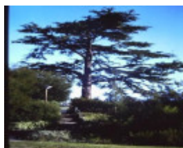
T11758 Cedrus deodara