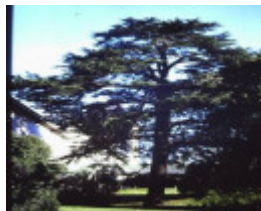
T11758 Cedrus deodara