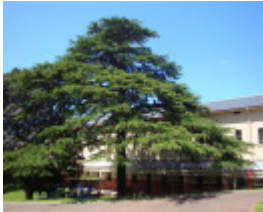
T11758 Cedrus deodara