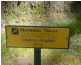
T11790 Quercus douglasii