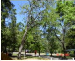
T11790 Quercus douglasii