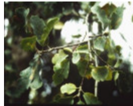
T11790 Quercus douglasii