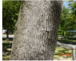
T11790 Quercus douglasii