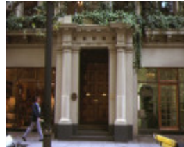
portland house collins street melb detail entrance