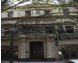
1 portland house collins street melb front view