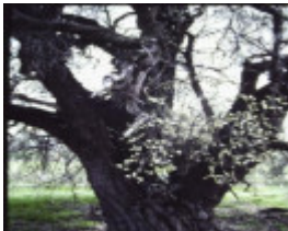
T11843 Prunus dulcis