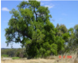
T11843 Prunus dulcis