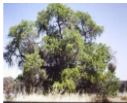
T11843 Prunus dulcis