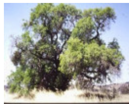
T11843 Prunus dulcis