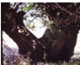
T11843 Prunus dulcis