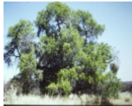
T11843 Prunus dulcis