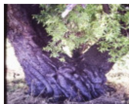
T11843 Prunus dulcis