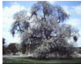
T11843 Prunus dulcis