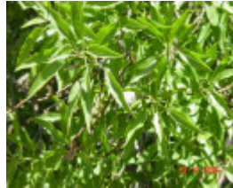
T11843 Prunus dulcis