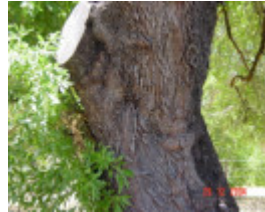
T11843 Prunus dulcis