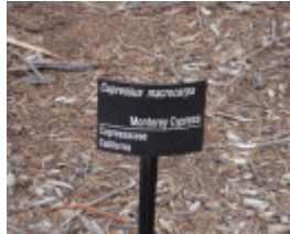
T11848 Cupressus macrocarpa