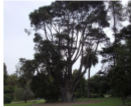
T11848 Cupressus macrocarpa