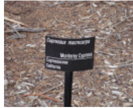
T11848 Cupressus macrocarpa