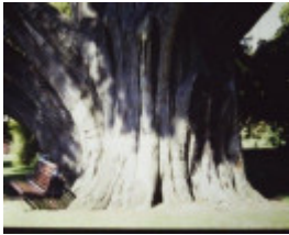
T11848 Cupressus macrocarpa