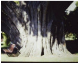
T11848 Cupressus macrocarpa