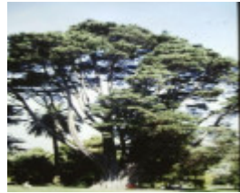
T11848 Cupressus macrocarpa