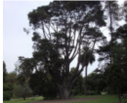
T11848 Cupressus macrocarpa