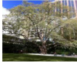
T11872 Platanus x acerifolia