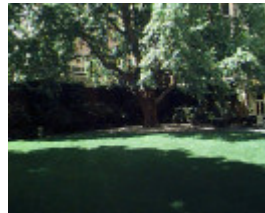
T11872 Platanus x acerifolia