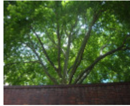
T11872 Platanus x acerifolia