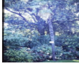
T11878 Trachycarpus fortunei