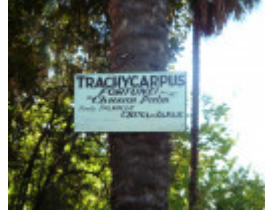
T11878 Trachycarpus fortunei