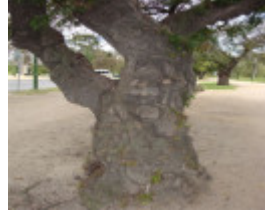
T11897 Schinus terebinthifolius