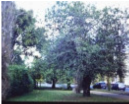
T11897 Schinus terebinthifolius