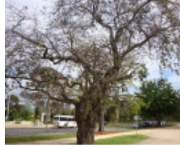
T11897 Schinus terebinthifolius