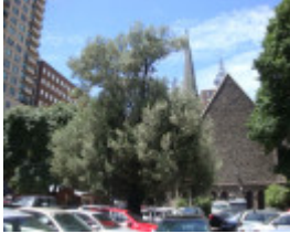
T11903 Olea europaea subsp. europaea