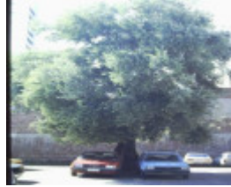
T11903 Olea europaea subsp. europaea