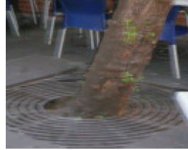
T11905 Pyrus communis