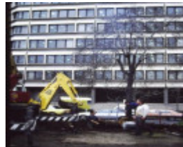
T11905 Pyrus communis relocation