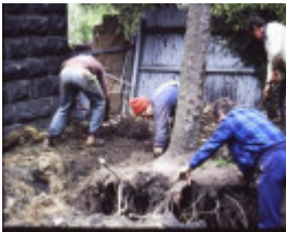
T11905 Pyrus communis relocation