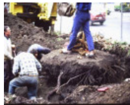
T11905.Pyrus communis relocation