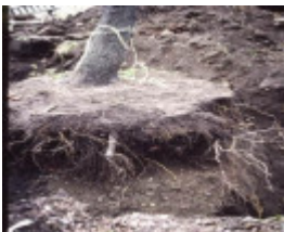
T11905 Pyrus communis relocation