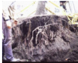
T11905 Pyrus communis relocation