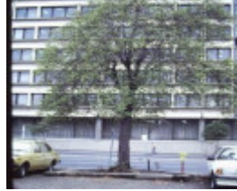
T11905 Pyrus communis