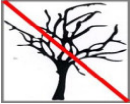
T11914 Metrosideros excelsa