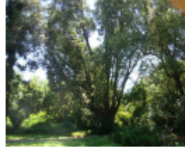
T11914 Metrosideros excelsa