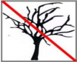
T11919 Quercus robur. Removed