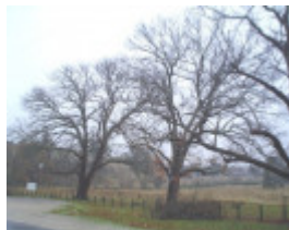
T11919 Quercus robur