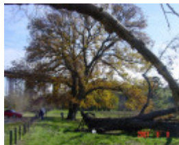
T11919 Quercus robur