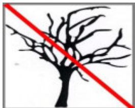
T11919 Quercus robur. Removed