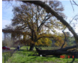
T11919 Quercus robur