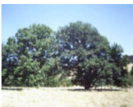
T11919 Quercus robur