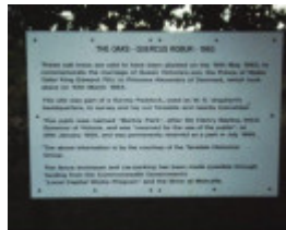
T11919 Quercus robur