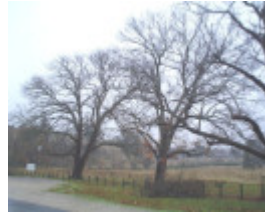
T11919 Quercus robur