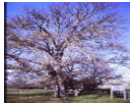
T11919 Quercus robur