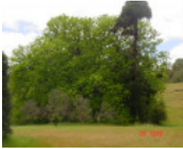
T11921 Quercus robur