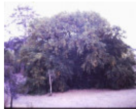
T11921 Quercus robur