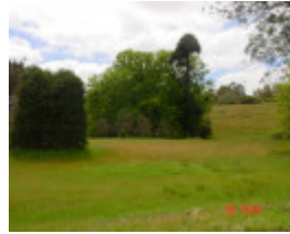
T11921 Quercus robur