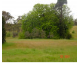
T11921 Quercus robur