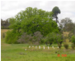
T11921 Quercus robur