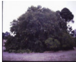
T11921 Quercus robur