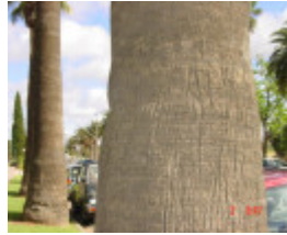
T11941 Washingtonia filifera