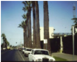
T11941 Washingtonia filifera