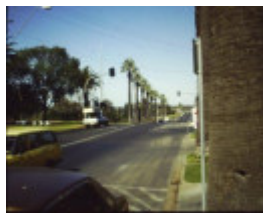
T11941 Washingtonia filifera