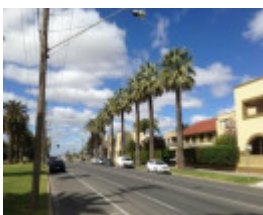
T11941 Washingtonia filifera