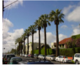
T11941 Washingtonia filifera