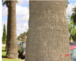
T11941 Washingtonia filifera