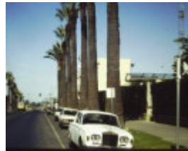
T11941 Washingtonia filifera