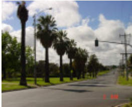
T11941 Washingtonia filifera