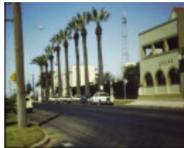
T11941 Washingtonia filifera