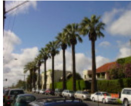
T11941 Washingtonia filifera