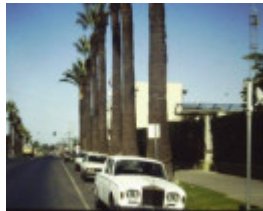
T11941 Washingtonia filifera