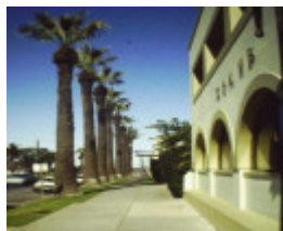
T11941 Washingtonia filifera