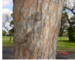
T11942 Pinus pinea