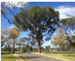
T11942 Pinus pinea