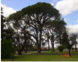
T11942 Pinus pinea