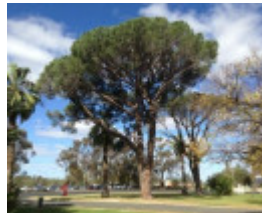
T11942 Pinus pinea