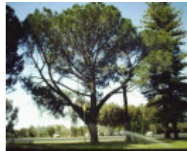
T11942 Pinus pinea