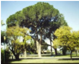
T11942 Pinus pinea