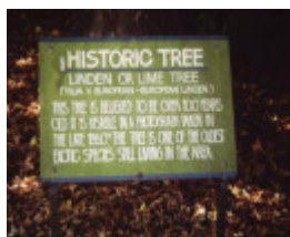
T11971 Tilia x europaea