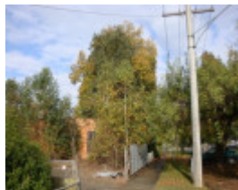
T11971 Tilia x europaea