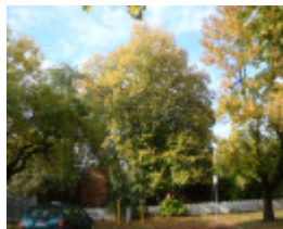
T11971 Tilia x europaea