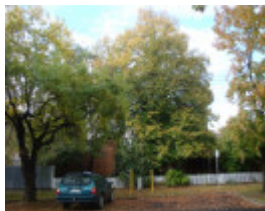
T11971 Tilia x europaea