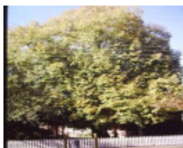
T11971 Tilia x europaea