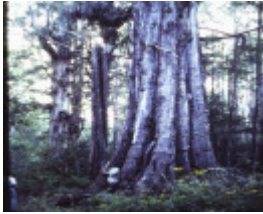
T11972 Eucalyptus denticulata