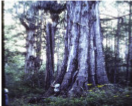
T11972 Eucalyptus denticulata