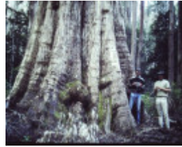
T11972 Eucalyptus denticulata