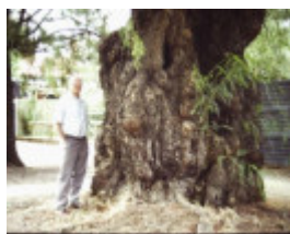
T11985 Schinus molle var areira