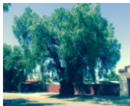
T11985 Schinus areira, Nathalia Feb 2015 (2).jpg