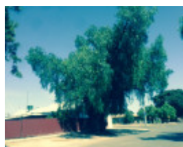
T11985 Schinus areira, Nathalia Feb 2015 (3).jpg