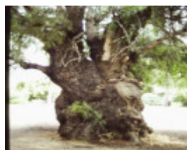
T11985 Schinus molle var areira