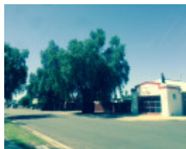
T11985 Schinus areira, Nathalia Feb 2015 (1).jpg