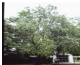
T11985 Schinus molle var areira