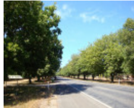
T12001 Quercus robur