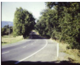
T12001 Quercus robur