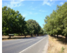
T12001 Quercus robur