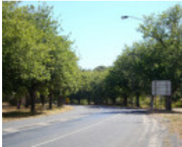
T12001 Quercus robur