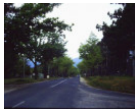
T12001 Quercus robur