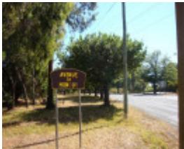
T12001 Quercus robur