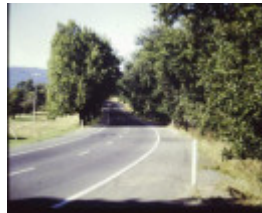
T12001 Quercus robur