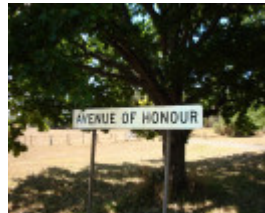
T12001 Quercus robur