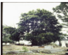
T12003 Nothofagus moorei