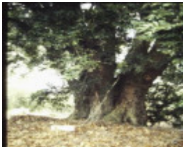
T12003 Nothofagus moorei