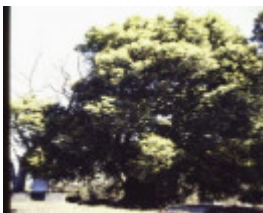
T12003 Nothofagus moorei