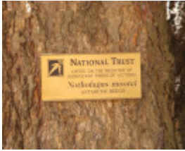
T12003 Nothofagus moorei