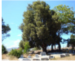
T12003 Nothofagus moorei