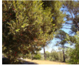
T12003 Nothofagus moorei