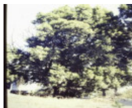
T12003 Nothofagus moorei