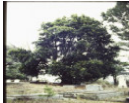
T12003 Nothofagus moorei