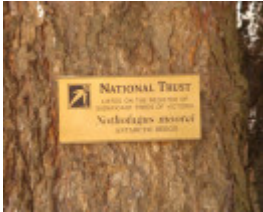
T12003 Nothofagus moorei