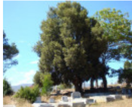
T12003 Nothofagus moorei