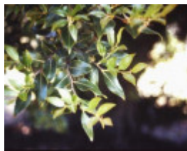
T12003 Nothofagus moorei