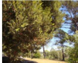
T12003 Nothofagus moorei