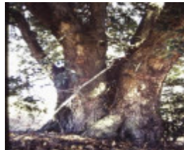
T12003 Nothofagus moorei