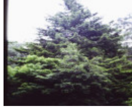
T12018 Sequoia sempervirens