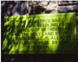
T12018 Sequoia sempervirens