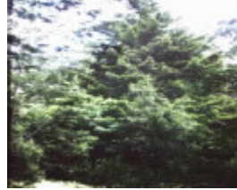
T12018 Sequoia sempervirens