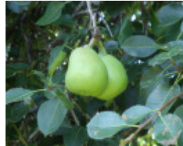
T12030 Pyrus communis