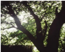
T12030 Pyrus communis