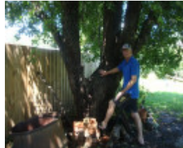
T12030 Pyrus communis