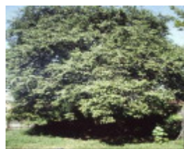
T12030 Pyrus communis