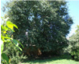
T12030 Pyrus communis