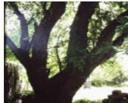
T12030 Pyrus communis