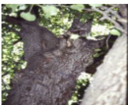
T12030 Pyrus communis