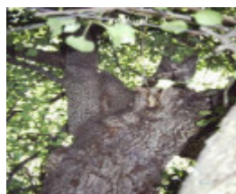
T12030 Pyrus communis