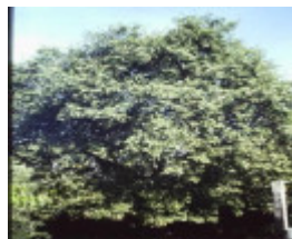
T12030 Pyrus communis