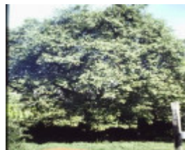
T12030 Pyrus communis