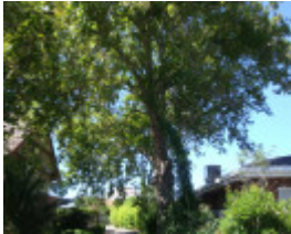
T12049 Platanus X acerifolia