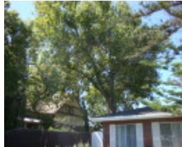
T12049 Platanus X acerifolia