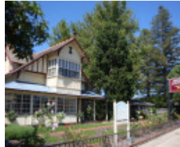
T12049 Platanus X acerifolia