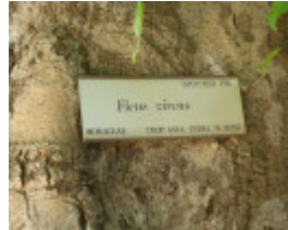
T12051 Ficus virens