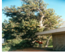
T12055 Banksia serrata