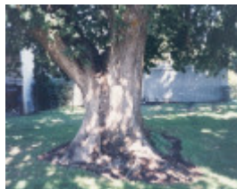
T12057 Ulmus x hollandica