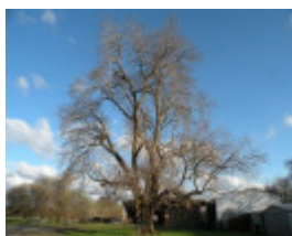
T12057 Ulmus x hollandica