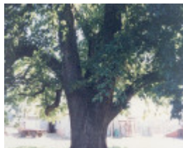
T12057 Ulmus x hollandica