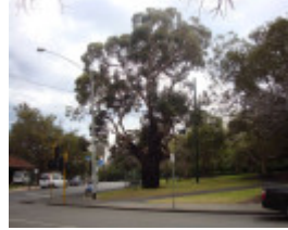
T12071 Eucalyptus cornuta