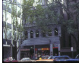
1 melville house collins street melbourne front view