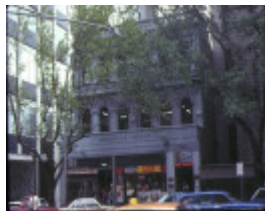
MELVILLE HOUSE SOHE 2008 1 melville house collins street melbourne front view