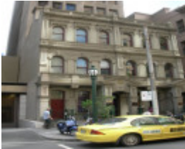
MELVILLE HOUSE SOHE 2008