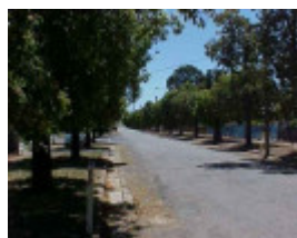
t12082 Brachychiton populeus