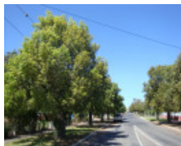
T12082 Brachychiton populeus