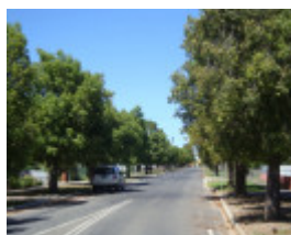
T12082 Brachychiton populeus