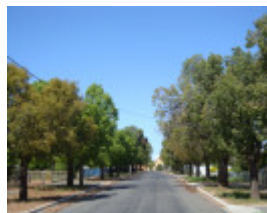
T12082 Brachychiton populeus