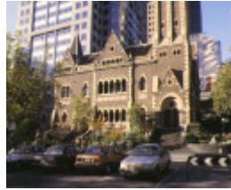
independent church of melbourne side detail apr1998