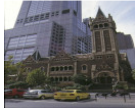
1 independent church of melbourne front view apr1998