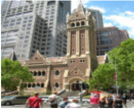
ST MICHAELS UNITING CHURCH SOHE 2008