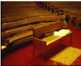
independent church of melb seating