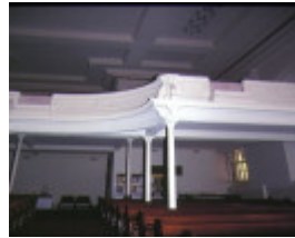
baptist church melb interior balcony