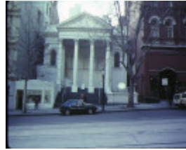
1 baptist church melb exterior front