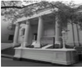
baptist church melb front elevation