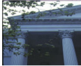
baptist church melb exterior columns