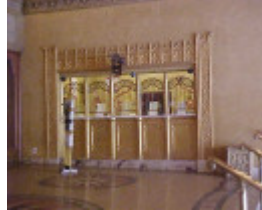
regent theatre collins street box office jul1999