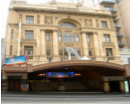
REGENT THEATRE SOHE 2008