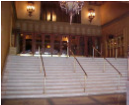
regent theatre collins street entrance steps jul1999