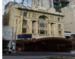
regent theatre collins street melbourne front view jul1999