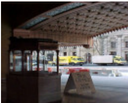
regent theatre collins street verandah detail jul1999