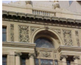
regent theatre collins street melbourne facade detail jul1999