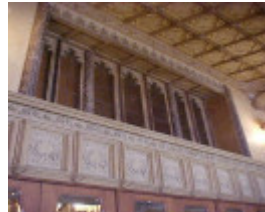
regent theatre collins street melbourne exterior foyer detail jul1999