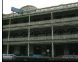
george hotel ballarat front detail