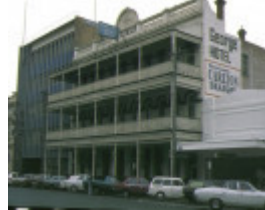
1 george hotel ballarat front view