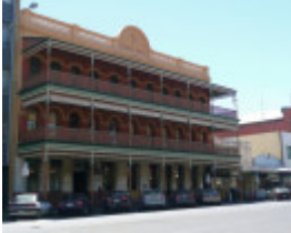
GEORGE HOTEL SOHE 2008