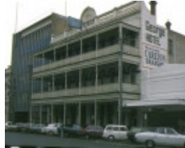
1 george hotel ballarat front view