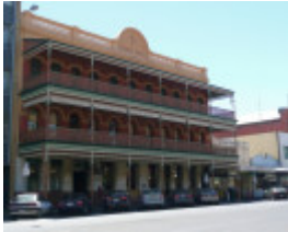
GEORGE HOTEL SOHE 2008