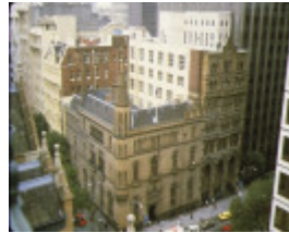
anz bank collins street melbourne birdseye view