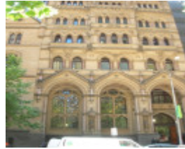
ANZ BANK SOHE 2008