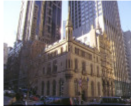
1 anz bank collins street melbourne external view