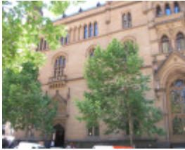
ANZ BANK SOHE 2008