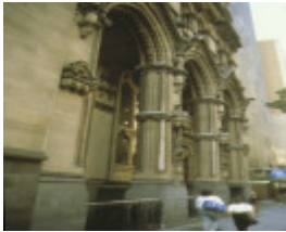
anz bank collins street melbourne entrance to former stock exchange