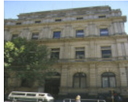
bank of australasia collins street melbourne front elevation feb1986