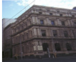
bank of australasia collins street melbourne front corner view jul1980