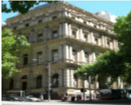
ANZ BANK SOHE 2008