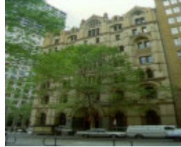
nmla building melb collins street facade sw oct99