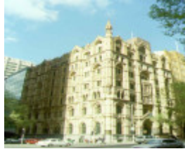
1 nmla building melb corner view sw oct99