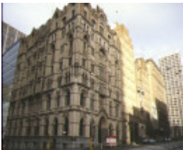
nmla building melb external view