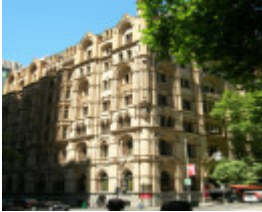
FORMER NATIONAL MUTUAL LIFE ASSOCIATION BUILDING SOHE 2008