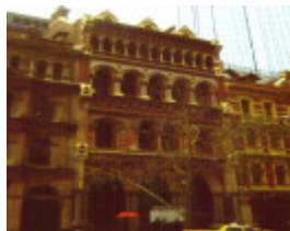
1 south australian insurance building h39