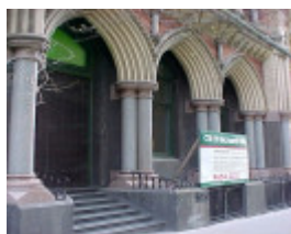
south australian insurance building collins street melbourne street view sep1999