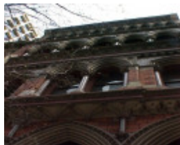
south australian insurance building collins street melbourne front elevation sep1999