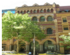
SOUTH AUSTRALIAN INSURANCE BUILDING SOHE 2008