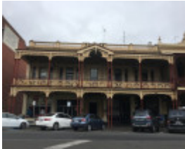
Alexandria Tea Rooms