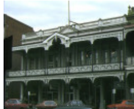
1 alexandria tea rooms ballarat front view