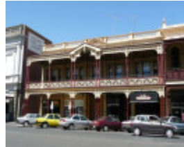
ALEXANDRIA TEA ROOMS SOHE 2008