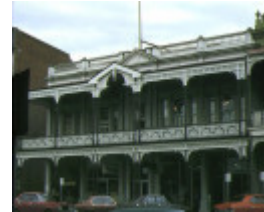
1 alexandria tea rooms ballarat front view