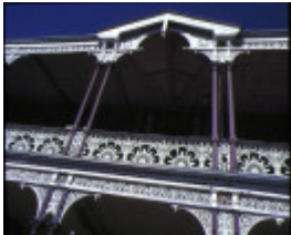
alexandria tea rooms ballarat detail lace