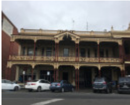
Alexandria Tea Rooms