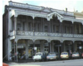
alexandria tea rooms ballarat front elevation