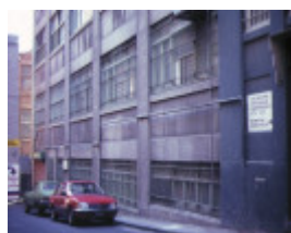
dovers building drewery lane melbourne rear view nov1985