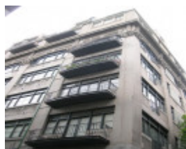
DOVERS BUILDING SOHE 2008