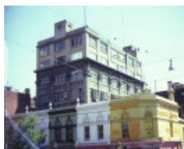
1 dovers building drewery lane melbourne front corner view nov1985