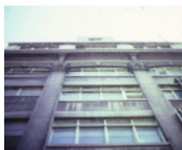
dovers building drewery lane melbourne detail of front windows nov1985