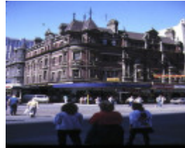
1 melbourne city building elizabeth street melbourne corner view feb1986