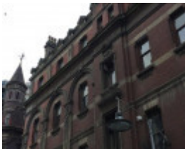
MELBOURNE CITY BUILDING July 2016