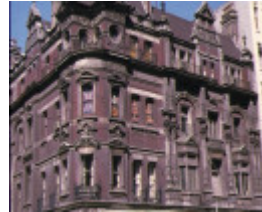
melbourne city building elizabeth street melbourne front detail feb1978