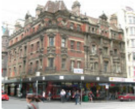
MELBOURNE CITY BUILDING SOHE 2008