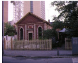
1 mickveh yisrael synagogue exhibition street melbourne front view jun1995