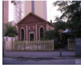
1 mickveh yisrael synagogue exhibition street melbourne front view jun1995