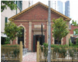
FORMER MICKVEH YISRAEL SYNAGOGUE AND SCHOOL SOHE 2008