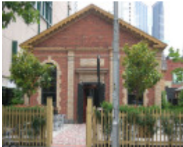
FORMER MICKVEH YISRAEL SYNAGOGUE AND SCHOOL SOHE 2008