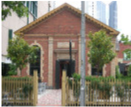
FORMER MICKVEH YISRAEL SYNAGOGUE AND SCHOOL SOHE 2008