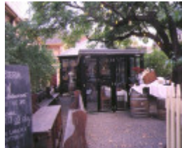
mickveh yisrael synagogue exhibition street melbourne rear view jun1995