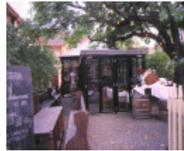
mickveh yisrael synagogue exhibition street melbourne rear view jun1995