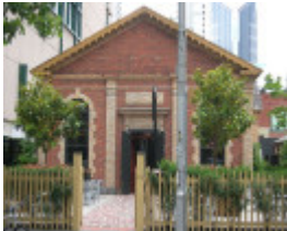
FORMER MICKVEH YISRAEL SYNAGOGUE AND SCHOOL SOHE 2008