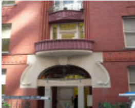
MILTON HOUSE SOHE 2008