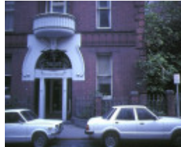
milton house flinders lane melb entrance oct1982