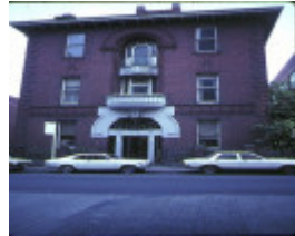
Milton House Flinders Lane Melbourne Front View October 1982