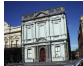
1 fine art gallery ballarat front view feb1990