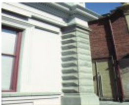
fine art gallery ballarat pillar detail