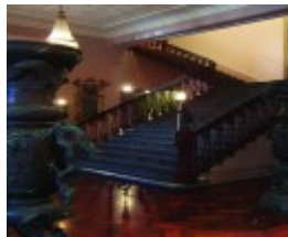
Art Gallery post restoration 2010