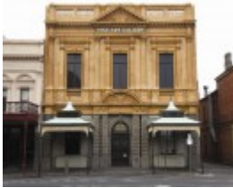
BALLARAT ART GALLERY_Restored Facade_Compressed.jpg 2010