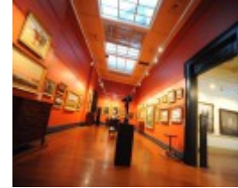
BALLARAT ART GALLERY_Colonial Gallery_2.jpg 2010