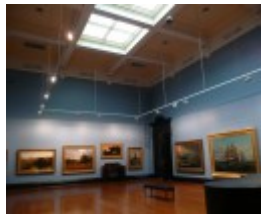
FINE ART GALLERY SOHE 2008