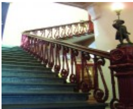
Art Gallery post restoration 2010