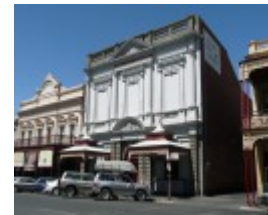
FINE ART GALLERY SOHE 2008