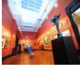
BALLARAT ART GALLERY_Colonial Gallery_1.jpg 2010