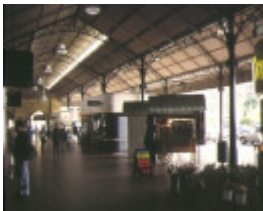
flinders street railway station complex flinders street melbourne interior along st kilda road