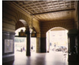
flinders street railway station complex flinders street melbourne entrance foyer