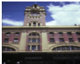
flinders street railway station complex flinders street melbourne tower view