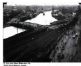
Flinder Street 1910.JPG