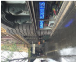
FLINDERS STREET RAILWAY STATION COMPLEX October 2016