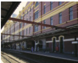
flinders street railway station complex flinders street melbourne side view