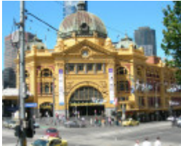
FLINDERS STREET RAILWAY STATION COMPLEX SOHE 2008