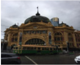
FLINDERS STREET RAILWAY STATION COMPLEX October 2016