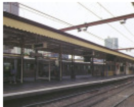
flinders street railway station complex flinders street melbourne platform view 1998