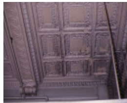
flinders street railway station complex flinders street melbourne pressed metal ceiling