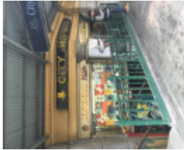
FLINDERS STREET RAILWAY STATION COMPLEX October 2016