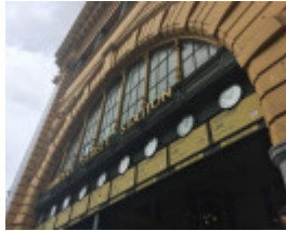
FLINDERS STREET RAILWAY STATION COMPLEX October 2016