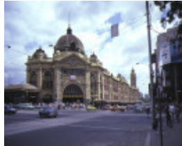
1 flinders street railway station complex flinders street melbourne front view feb1985