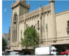
FORUM AND RAPALLO CINEMAS SOHE 2008