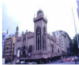
h00438 1 forum theatre flinders street melbourne external view she project 2003