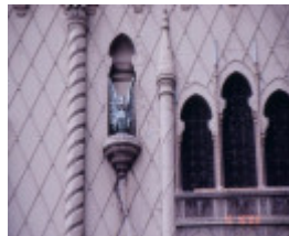
h00438 forum theatre flinders street melbourne external statues she project 2003