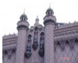
h00438 forum theatre flinders street melbourne flinders street statues she project 2003