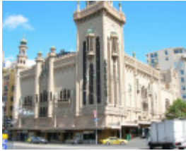
FORUM AND RAPALLO CINEMAS SOHE 2008