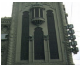
former state theatre flinders street melbourne external detail side sign