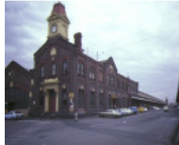
number 3 goods shed & offices flinders street extension melbourne side elevation jan1985