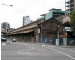
NO.2 GOODS SHED SOHE 2008