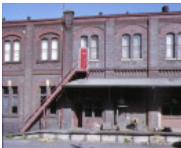
number 3 goods shed & offices flinders street melbourne side elevation