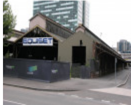
NO.2 GOODS SHED SOHE 2008