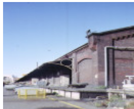
number 3 goods shed & offices flinders street extension melbourne side view